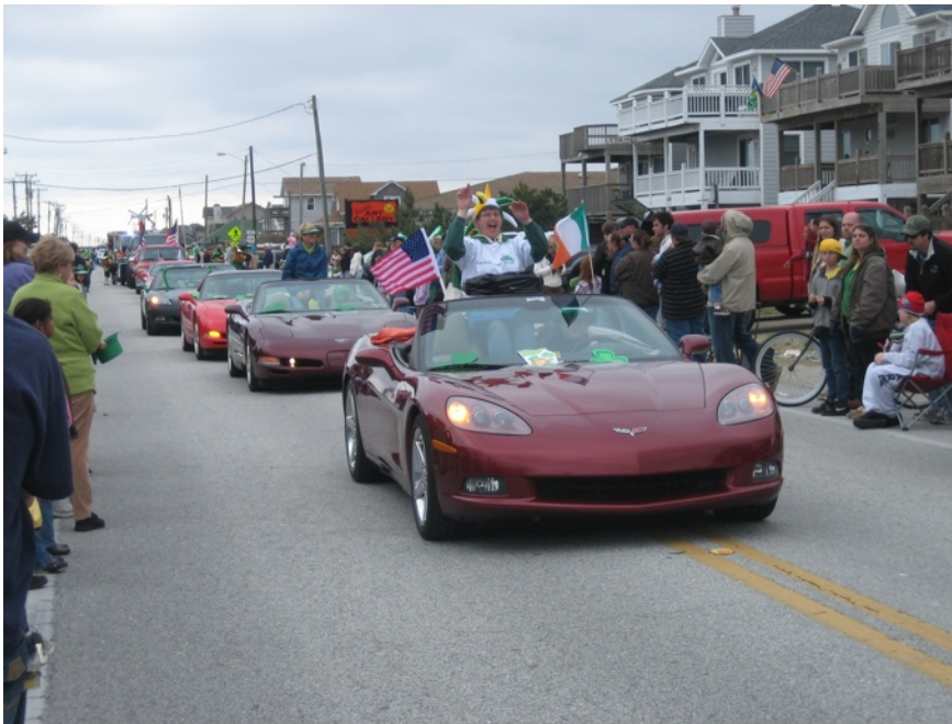
Friday March 18 - Sunday March 20th