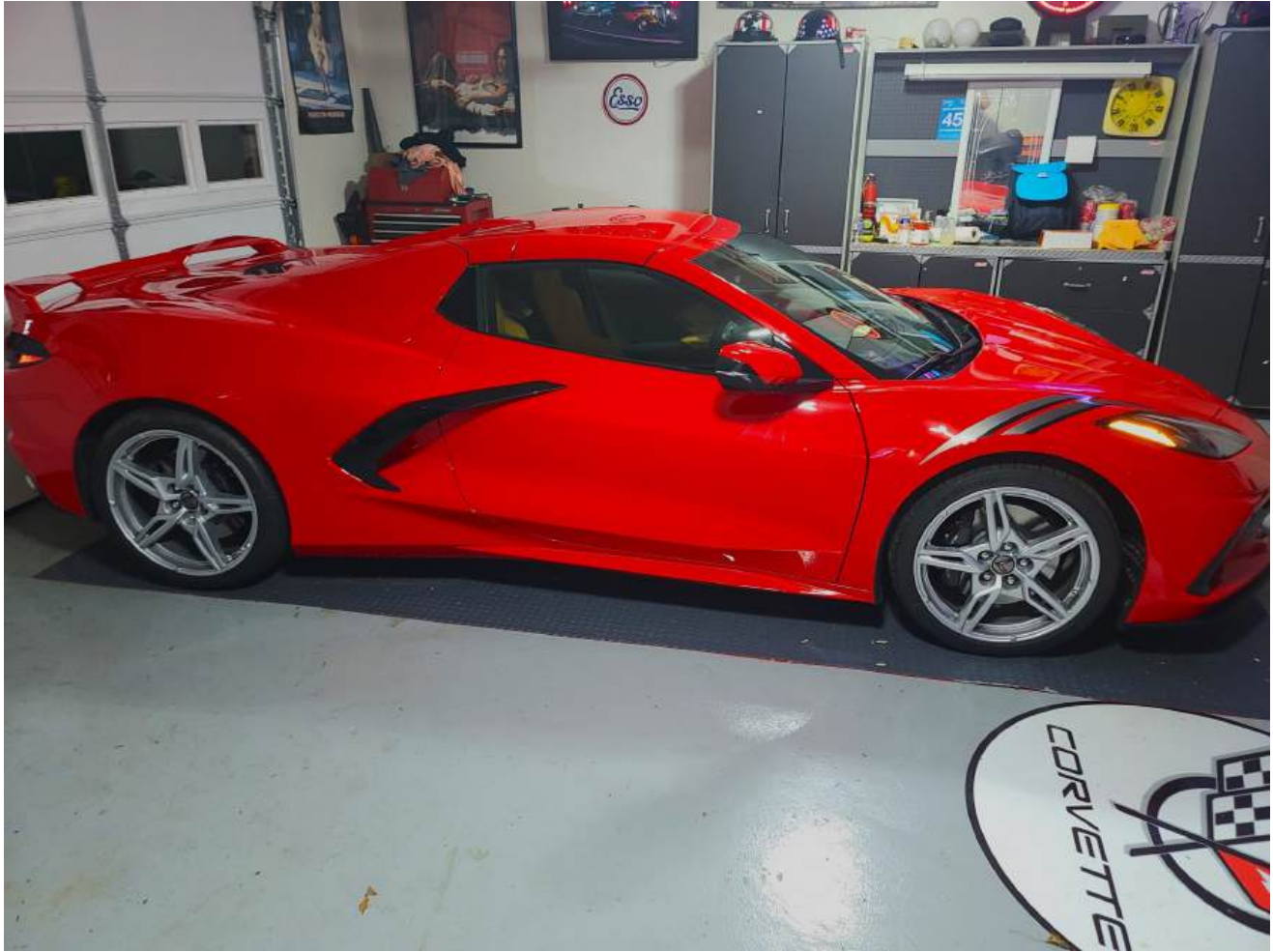
Cleveland Anderson's beautiful Torch Red C8